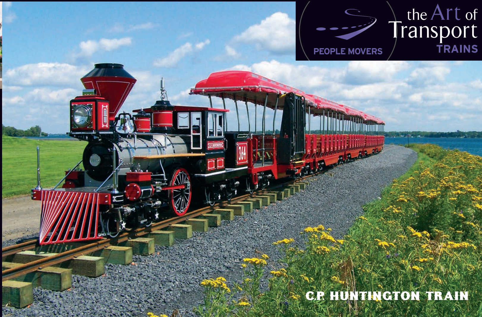
C.P. HUNTINGTON TRAIN