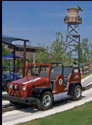
OFF-ROAD ADVENTURE RIDE