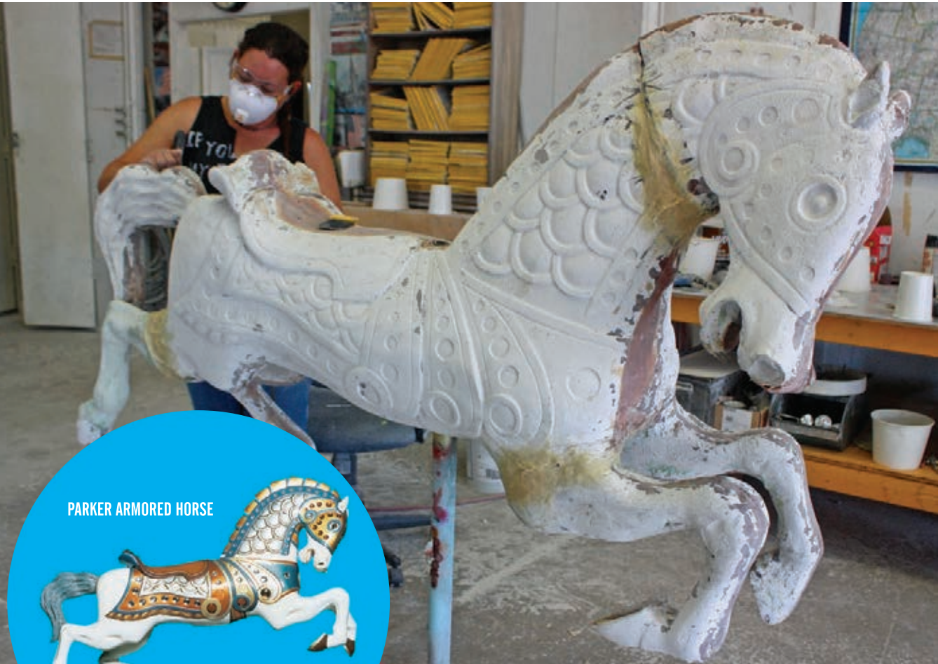
PARKER ARMORED HORSE