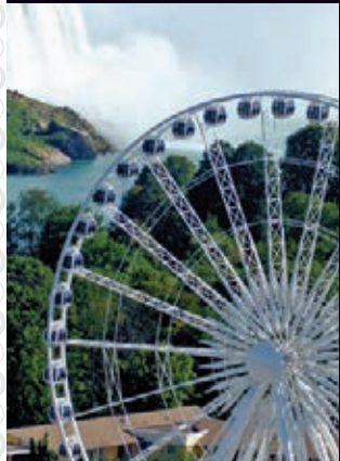
R60 GIANT WHEEL

The Chance Rides workshop and factory is a marvel of craftsmanship. Bradley & Kaye antique horses are painstakingly replicated from castings, then painted by hand, just as they were a century ago.