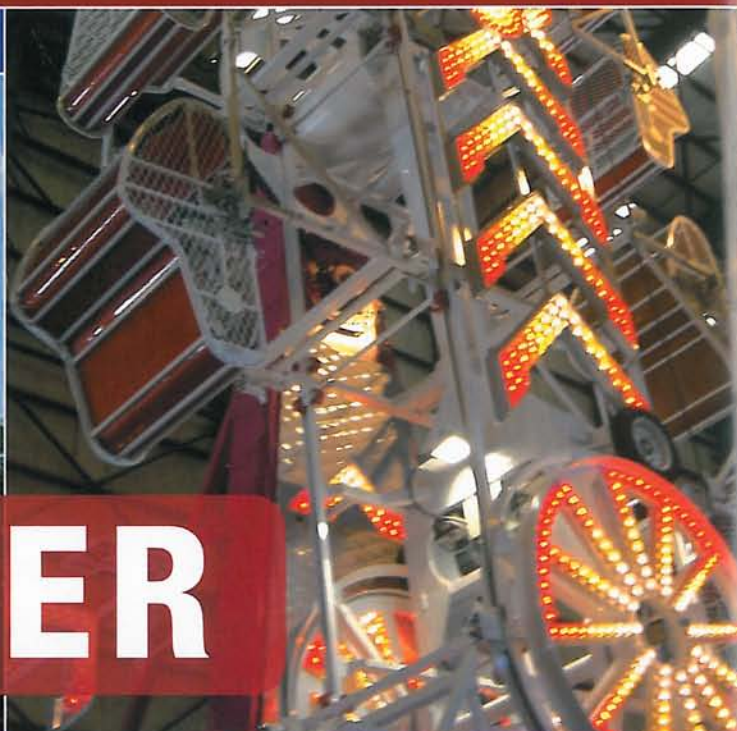
Coleman Brothers Shows, Inc. Refurbished Zipper