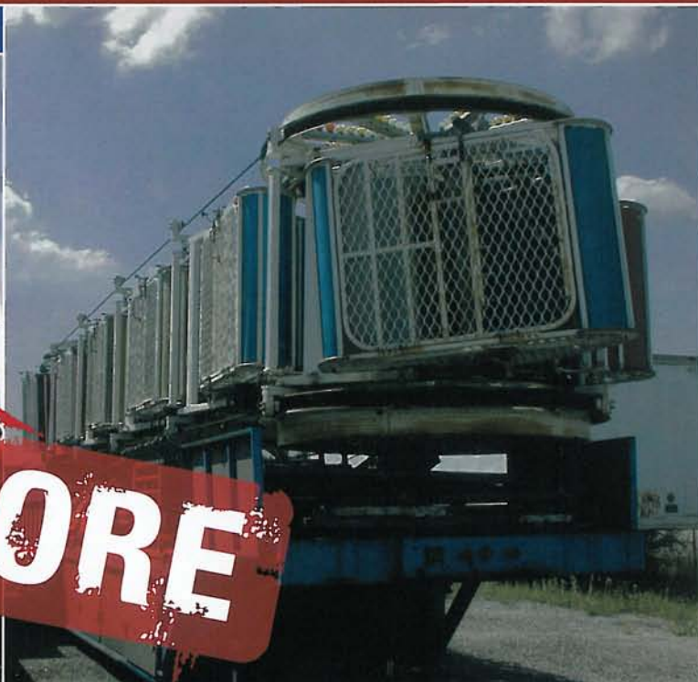
Worn Out 1995 Zipper