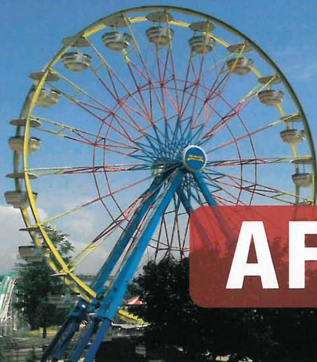
Michigan's Adventure Refurbished Giant Wheel