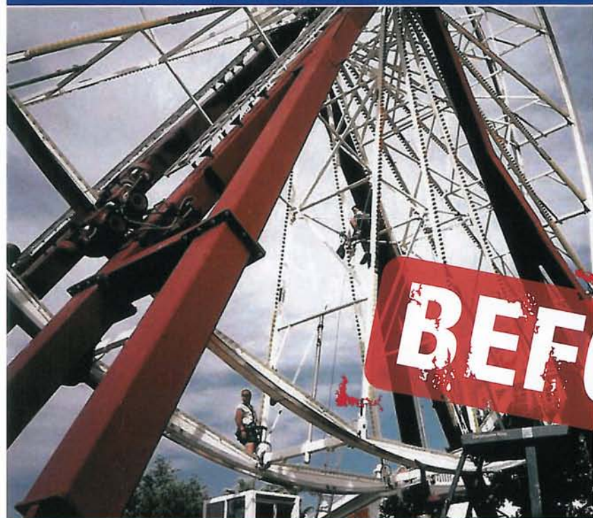
Worse For Wear 1989 Giant Wheel